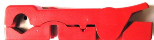
Blown Fibre Crimper/Tube Cutter Tool